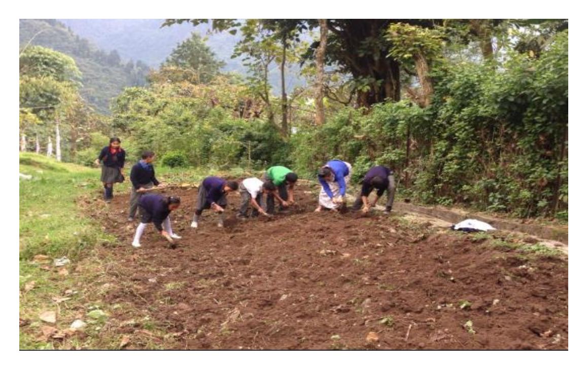
PREPARING FIELD FOR KITCHEN GARDEN AT SCHOOL.