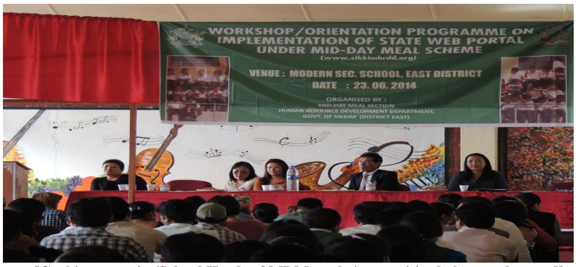
[Cooking agencies/School Heads of MDM are being sensitized about web portal]

The MDM Cell, HRDD had conducted training and awareness programme of web portal to all heads of the institution, training to cook cum helpers, stake holders and SMDC under mid-day meal scheme in all four districts during 2013. All the heads of the institutions and SMC had attended the training cum awareness programme of MDM Section held at various district levels in presence of district officials, MDM in-charge, Assistant Directors and Asst. Education Officers of the Block Administrative Centre BAC. Series of interaction between SMDC and Head of schools were held. Apart from this, School heads are being sensitized by the officers at the BAC level during coordination meetings.