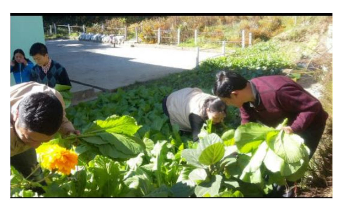
GREEN VEGETABLE [RAI SAAG] AT SCHOOL