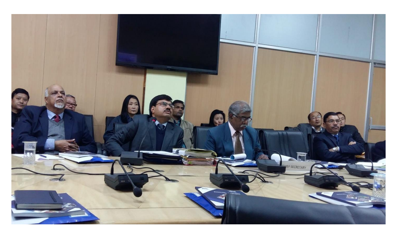
[HAND WASH BEFORE MID-DAY MEAL]