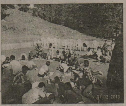
Children of Kingston destitute home take part in painting competition