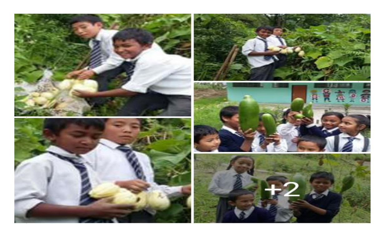
STUDENTS COLLECTING [COCUMBER & SQUASH]